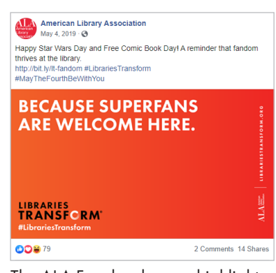
The ALA Facebook page highlights a Libraries Transform Because statement.