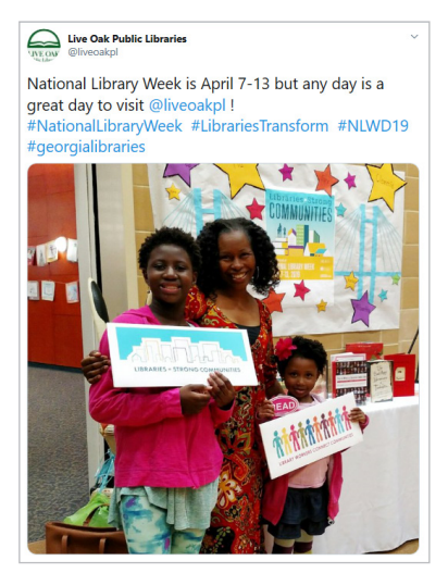
Live Oak Public Libraries (GA) joins the National Library Week festivities in a Twitter post.

Statistics reflect the period from September 1, 2018 to August 31, 2019. Media numbers were compiled using ALA's monitoring software Cision.