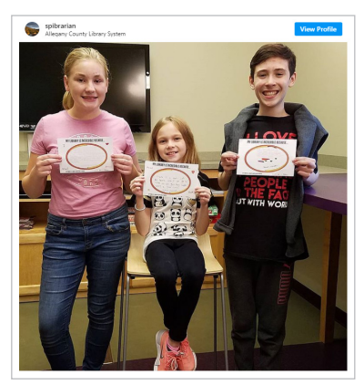
On Instagram, the Allegany County Library System (MD) celebrates Library Card Sign-up Month.